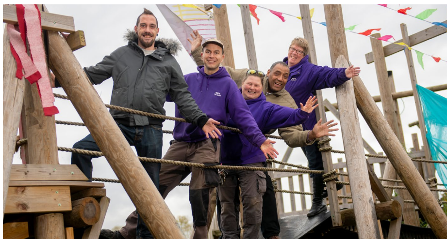
Staff and volunteers at the adventure playground

Solihull Council is set to lease a piece of land in Meriden Park so that the current adventure playground can become a long-standing facility for local families.