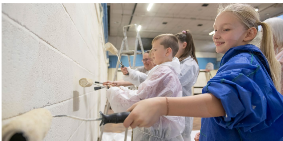
Local children help renovate the space

The Kingshurst Community Space pilot will be opening its doors soon. Watch this space!