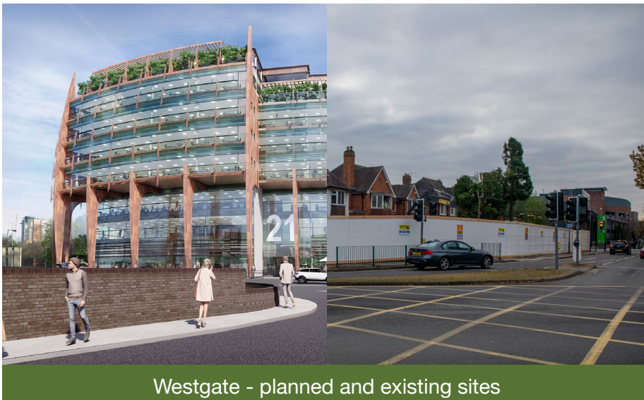
Westgate - planned and existing sites

Visitors to the town centre will have noticed the recent activity on Homer Road. This location is earmarked for an exciting new development, aiming to be one of the most environmentally-friendly in Solihull.